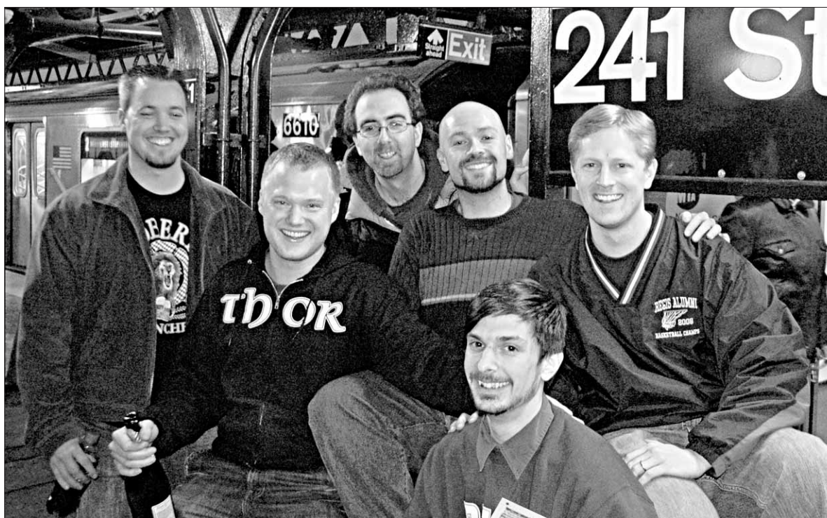
The "Subway Six" had to painstakingly document their journey to earn a place in the Guinness World Records.